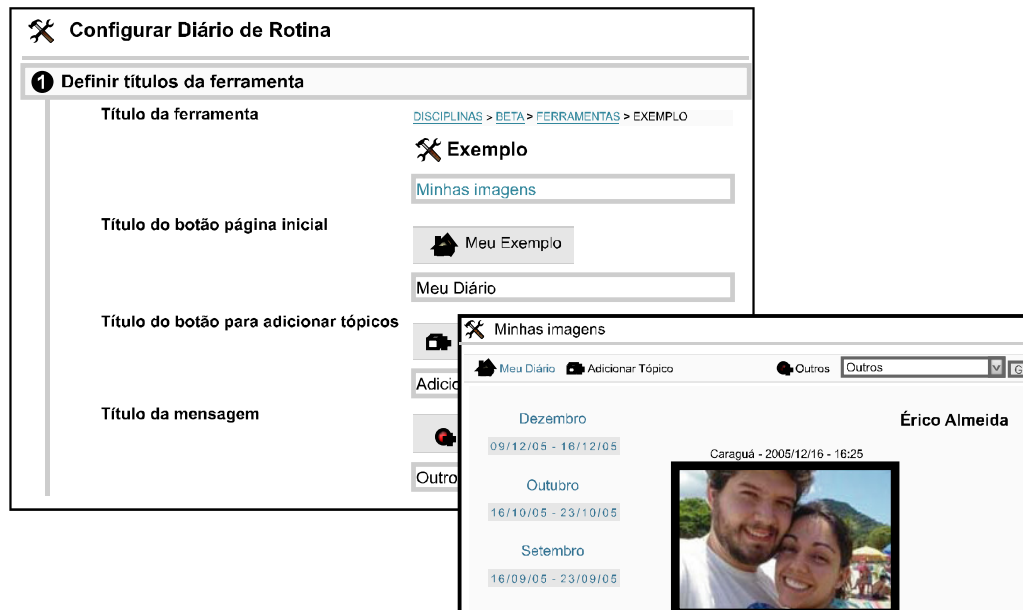
Figure 6.2: Example of the area of configuration and utilization of the Routine Diary tool.

In this case we developed a Building Block that enabled the teachers to alter not only the name of the tool, but also all the texts of its interface.