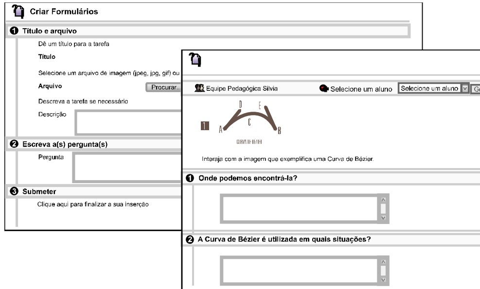
Figure 6.3: Example of the area of configuration and utilization of the Form tool.