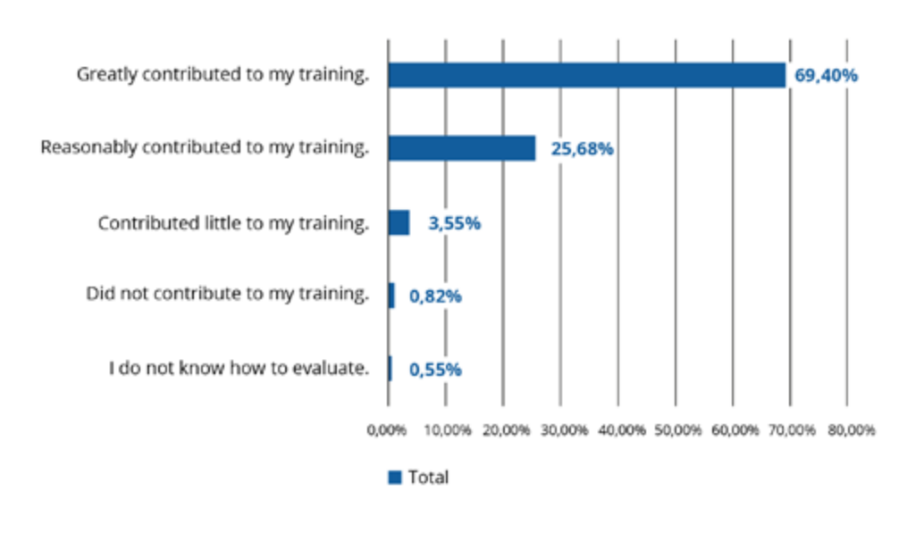
Graph I — General Evaluation of the Program